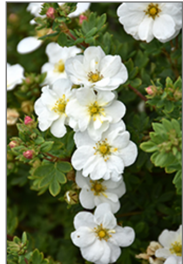
Frosty Potentilla flowers

This is a relatively low maintenance shrub, and is best pruned in late winter once the threat of extreme cold has passed. It is a good choice for attracting butterflies to your yard, but is not particularly attractive to deer who tend to leave it alone in favor of tastier treats. It has no significant negative characteristics.