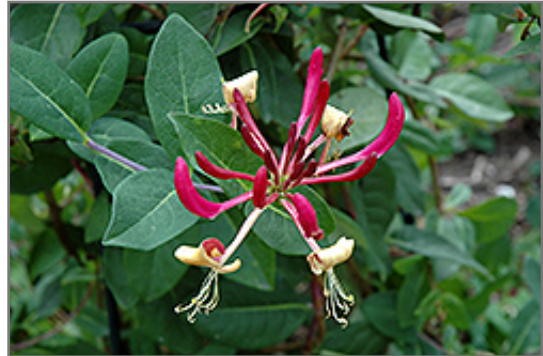
Peaches And Cream Honeysuckle flowers

Peaches And Cream Honeysuckle is a multi-stemmed deciduous woody vine with a twining and trailing habit of growth. Its average texture blends into the landscape, but can be balanced by one or two finer or coarser trees or shrubs for an effective composition.