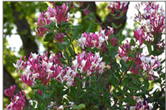
Peaches And Cream Honeysuckle flowers