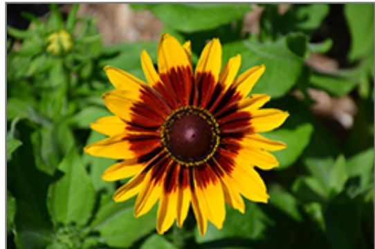
Denver Daisy Coneflower flowers

Denver Daisy Coneflower is an herbaceous perennial with an upright spreading habit of growth. Its medium texture blends into the garden, but can always be balanced by a couple of finer or coarser plants for an effective composition.