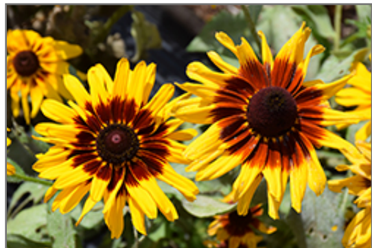
Denver Daisy Coneflower flowers

We are so proud of the nursery stock that we have carefully selected for superior quality and performance, WE GUARANTEE ALL TREES, SHRUBS, EVERGREENS FOR 2 YEARS, AND ROSES FOR 1 YEAR!