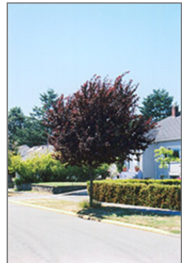
Newport Plum

We are so proud of the nursery stock that we have carefully selected for superior quality and performance, WE GUARANTEE ALL TREES, SHRUBS, EVERGREENS FOR 2 YEARS, AND ROSES FOR 1 YEAR!