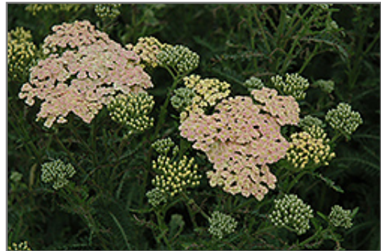
Summer Pastels Yarrow flowers