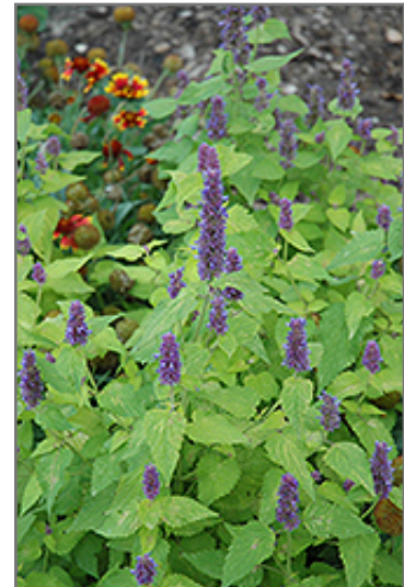
Golden Jubilee Anise Hyssop flowers

Golden Jubilee Anise Hyssop is a dense herbaceous perennial with an upright spreading habit of growth. Its medium texture blends into the garden, but can always be balanced by a couple of finer or coarser plants for an effective composition.