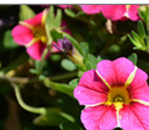
Superbells Cherry Star Calibrachoa flowers

Kimberly 710 Cobblestone Lane (920) 687-5013