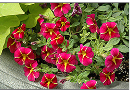
Superbells Cherry Star Calibrachoa flowers