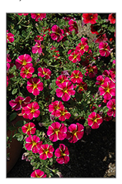
Superbells Cherry Star Calibrachoa

Superbells Cherry Star Calibrachoa is a dense herbaceous annual with a trailing habit of growth, eventually spilling over the edges of hanging baskets and containers. Its medium texture blends into the garden, but can always be balanced by a couple of finer or coarser plants for an effective composition.