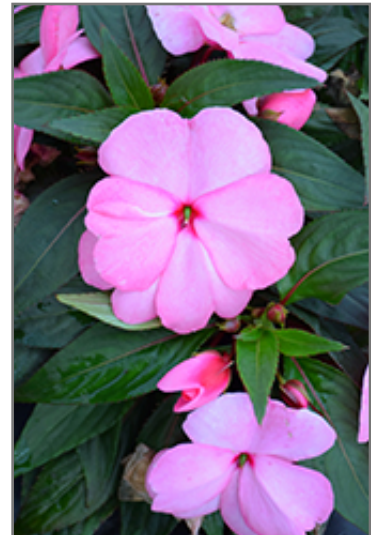
Sonic Light Pink New Guinea Impatiens flowers

We are so proud of the nursery stock that we have carefully selected for superior quality and performance, WE GUARANTEE ALL TREES, SHRUBS, EVERGREENS FOR 2 YEARS, AND ROSES FOR 1 YEAR!