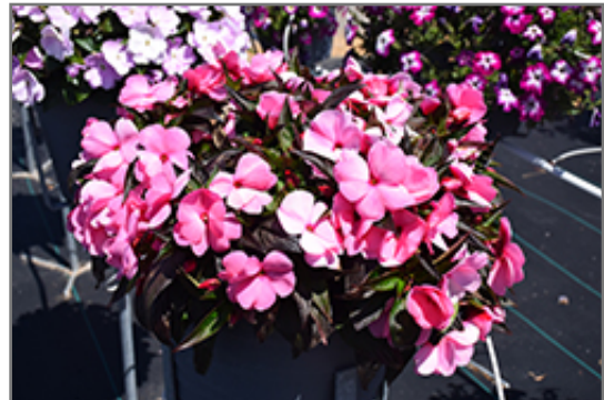
Sonic Light Pink New Guinea Impatiens in bloom