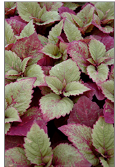
ColorBlaze Royal Glissade Coleus foliage

We are so proud of the nursery stock that we have carefully selected for superior quality and performance, WE GUARANTEE ALL TREES, SHRUBS, EVERGREENS FOR 2 YEARS, AND ROSES FOR 1 YEAR!