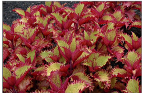
Henna Coleus foliage

Henna Coleus is recommended for the following landscape applications;