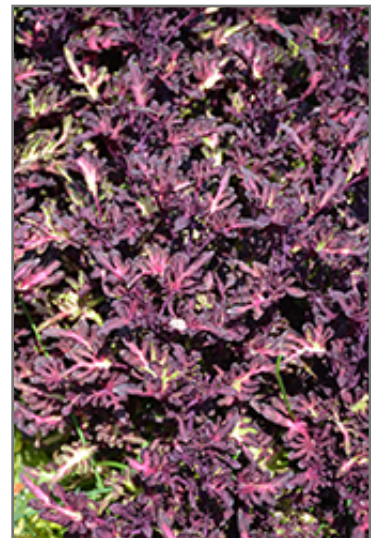
Merlin's Magic Coleus foliage

We are so proud of the nursery stock that we have carefully selected for superior quality and performance, WE GUARANTEE ALL TREES, SHRUBS, EVERGREENS FOR 2 YEARS, AND ROSES FOR 1 YEAR!