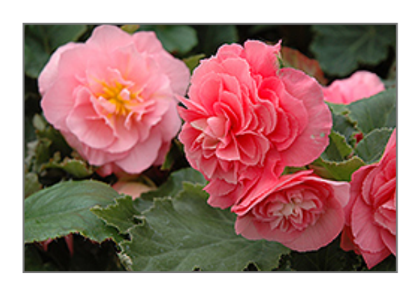
Nonstop Pink Begonia flowers