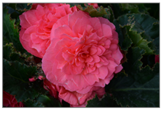
Nonstop Pink Begonia flowers

Nonstop Pink Begonia features dainty pink frilly flowers at the ends of the stems from mid spring to mid fall. Its succulent heart-shaped leaves remain green in color throughout the season.