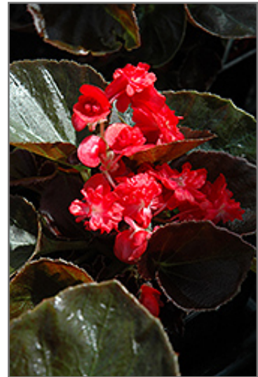
Doublet Red Begonia flowers

This is a high maintenance plant that will require regular care and upkeep, and usually looks its best without pruning, although it will tolerate pruning. Deer don't particularly care for this plant and will usually leave it alone in favor of tastier treats. Gardeners should be aware of the following characteristic(s) that may warrant special consideration;