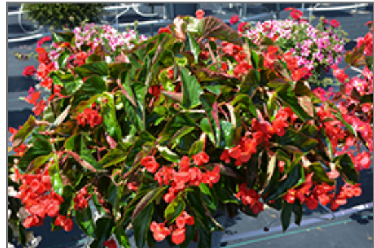
Dragon Wing Red Begonia in bloom