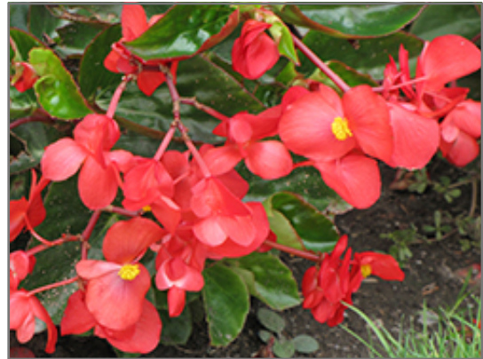
Dragon Wing Red Begonia flowers

Dragon Wing Red Begonia is an herbaceous annual with a trailing habit of growth, eventually spilling over the edges of hanging baskets and containers. Its medium texture blends into the garden, but can always be balanced by a couple of finer or coarser plants for an effective composition.