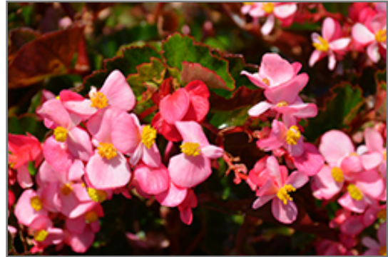
BabyWing Pink Begonia flowers

BabyWing Pink Begonia is an herbaceous annual with a mounded form. Its medium texture blends into the garden, but can always be balanced by a couple of finer or coarser plants for an effective composition.