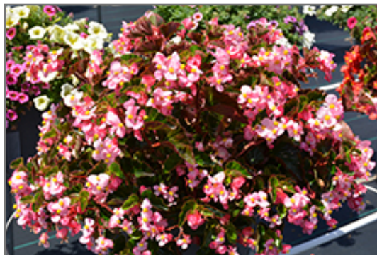
BabyWing Pink Begonia in bloom

BabyWing Pink Begonia is a fine choice for the garden, but it is also a good selection for planting in outdoor containers and hanging baskets. It is often used as a 'filler' in the 'spiller-thriller-filler' container combination, providing a mass of flowers and foliage against which the thriller plants stand out. Note that when growing plants in outdoor containers and baskets, they may require more frequent waterings than they would in the yard or garden.