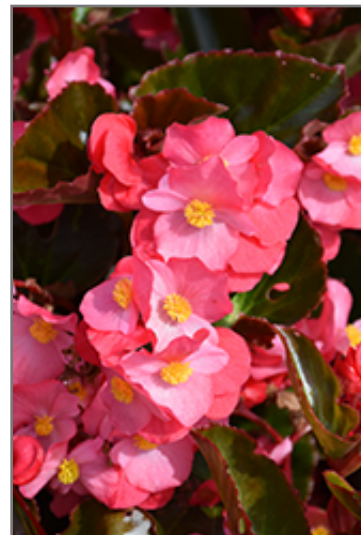
Big Rose Bronze Leaf Begonia flowers

This is a high maintenance plant that will require regular care and upkeep, and usually looks its best without pruning, although it will tolerate pruning. Deer don't particularly care for this plant and will usually leave it alone in favor of tastier treats. Gardeners should be aware of the following characteristic(s) that may warrant special consideration;