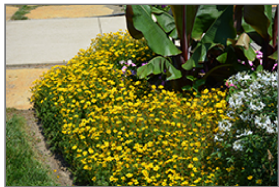
Goldilocks Rocks Bidens in bloom

We are so proud of the nursery stock that we have carefully selected for superior quality and performance, WE GUARANTEE ALL TREES, SHRUBS, EVERGREENS FOR 2 YEARS, AND ROSES FOR 1 YEAR!