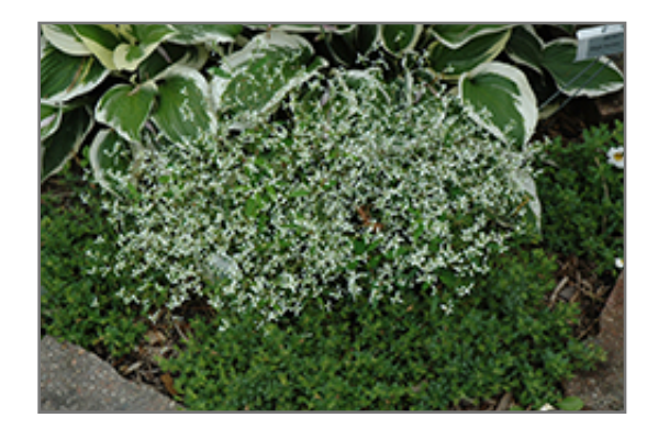
Diamond Frost Euphorbia in bloom