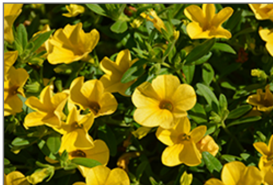
Cabaret Deep Yellow Calibrachoa flowers

This plant will require occasional maintenance and upkeep. Trim off the flower heads after they fade and die to encourage more blooms late into the season. It is a good choice for attracting bees and hummingbirds to your yard, but is not particularly attractive to deer who tend to leave it alone in favor of tastier treats. It has no significant negative characteristics.