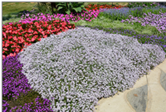
Blushing Princess Sweet Alyssum in bloom