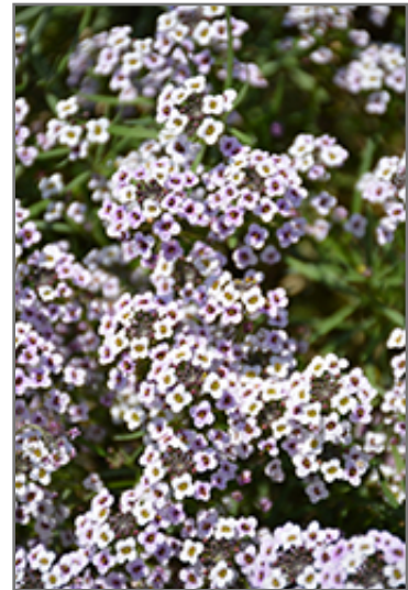
Blushing Princess Sweet Alyssum flowers

Blushing Princess Sweet Alyssum is a dense herbaceous annual with a trailing habit of growth, eventually spilling over the edges of hanging baskets and containers. It brings an extremely fine and delicate texture to the garden composition and should be used to full effect.