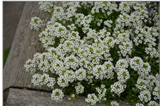
Snow Princess Alyssum flowers

This plant will require occasional maintenance and upkeep, and should not require much pruning, except when necessary, such as to remove dieback. It is a good choice for attracting bees and butterflies to your yard, but is not particularly attractive to deer who tend to leave it alone in favor of tastier treats. It has no significant negative characteristics.