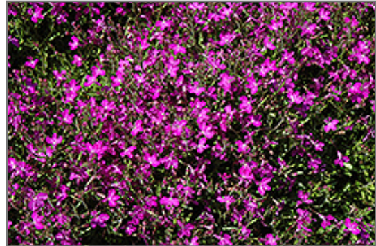
Techno Violet Lobelia flowers