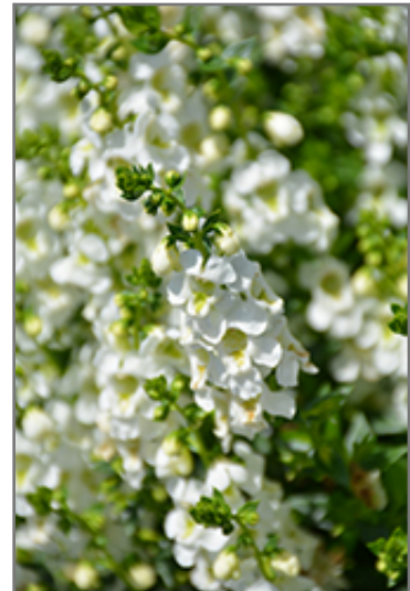
Serenita White Angelonia flowers

Serenita White Angelonia is an herbaceous annual with an upright spreading habit of growth. Its relatively fine texture sets it apart from other garden plants with less refined foliage.