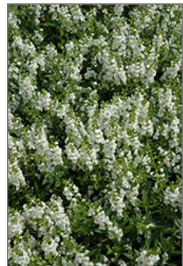
Serenita White Angelonia flowers

We are so proud of the nursery stock that we have carefully selected for superior quality and performance, WE GUARANTEE ALL TREES, SHRUBS, EVERGREENS FOR 2 YEARS, AND ROSES FOR 1 YEAR!