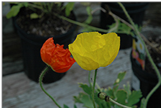
Wonderland Mix Poppy flowers

We are so proud of the nursery stock that we have carefully selected for superior quality and performance, WE GUARANTEE ALL TREES, SHRUBS, EVERGREENS FOR 2 YEARS, AND ROSES FOR 1 YEAR!