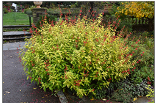
Golden Delicious Pineapple Sage in bloom

We are so proud of the nursery stock that we have carefully selected for superior quality and performance, WE GUARANTEE ALL TREES, SHRUBS, EVERGREENS FOR 2 YEARS, AND ROSES FOR 1 YEAR!