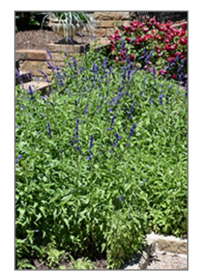
Victoria Blue Salvia in bloom Photo courtesy of NetPS Plant Finder

Victoria Blue Salvia flowers Photo courtesy of NetPS Plant Finder