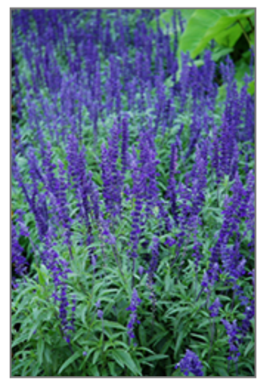
Victoria Blue Salvia flowers

Big Bend ne S71 W23445 National 0 (262) 662-5800