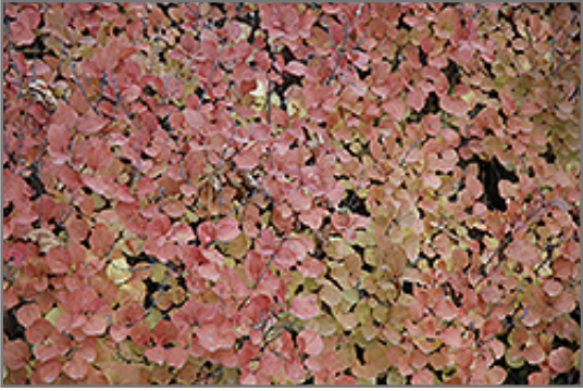
Dwarf Korean Lilac in fall

Dwarf Korean Lilac will grow to be about 4 feet tall at maturity, with a spread of 5 feet. It tends to fill out right to the ground and therefore doesn't necessarily require facer plants in front. It grows at a slow rate, and under ideal conditions can be expected to live for approximately 30 years.