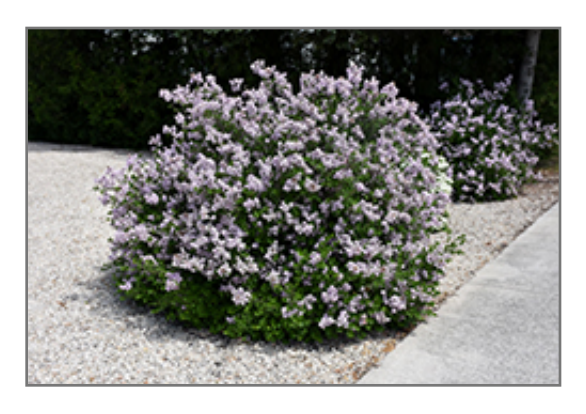
Dwarf Korean Lilac in bloom

This is a relatively low maintenance shrub, and should only be pruned after flowering to avoid removing any of the current season's flowers. It is a good choice for attracting butterflies to your yard. It has no significant negative characteristics.