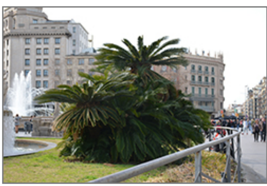
Japanese Sago Palm