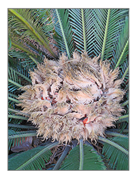
Japanese Sago Palm flowers

We are so proud of the nursery stock that we have carefully selected for superior quality and performance, WE GUARANTEE ALL TREES, SHRUBS, EVERGREENS FOR 2 YEARS, AND ROSES FOR 1 YEAR!