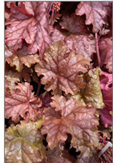
Carnival Peach Parfait Coral Bells foliage

This is a relatively low maintenance plant, and should be cut back in late fall in preparation for winter. It has no significant negative characteristics.