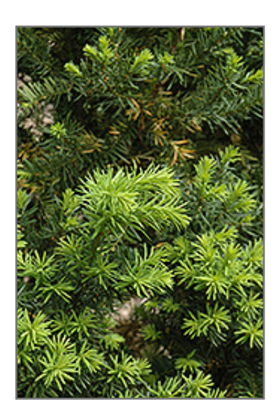
Hicks Yew foliage