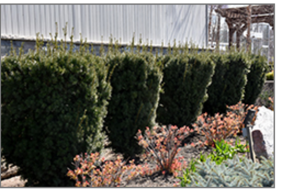
Hicks Yew

Hicks Yew will grow to be about 18 feet tall at maturity, with a spread of 10 feet. It has a low canopy with a typical clearance of 1 foot from the ground, and is suitable for planting under power lines. It grows at a slow rate, and under ideal conditions can be expected to live for 50 years or more.