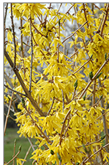
Northern Gold Forsythia flowers

We are so proud of the nursery stock that we have carefully selected for superior quality and performance, WE GUARANTEE ALL TREES, SHRUBS, EVERGREENS FOR 2 YEARS, AND ROSES FOR 1 YEAR!