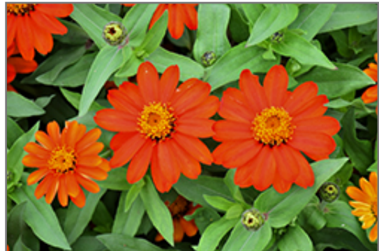
Zahara Fire Zinnia flowers

This is a relatively low maintenance plant. Trim off the flower heads after they fade and die to encourage more blooms late into the season. It is a good choice for attracting butterflies and hummingbirds to your yard. It has no significant negative characteristics.