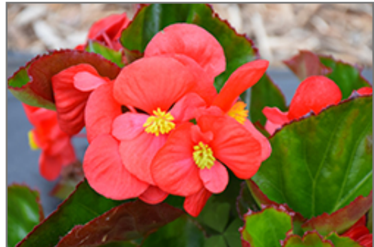
Big Red Green Leaf Begonia flowers

Big Red Green Leaf Begonia is an herbaceous annual with an upright spreading habit of growth. Its medium texture blends into the garden, but can always be balanced by a couple of finer or coarser plants for an effective composition.