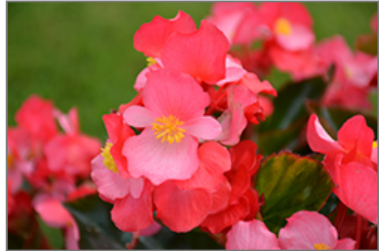
Surefire Rose Begonia flowers

Surefire Rose Begonia is an herbaceous annual with an upright spreading habit of growth. Its medium texture blends into the garden, but can always be balanced by a couple of finer or coarser plants for an effective composition.