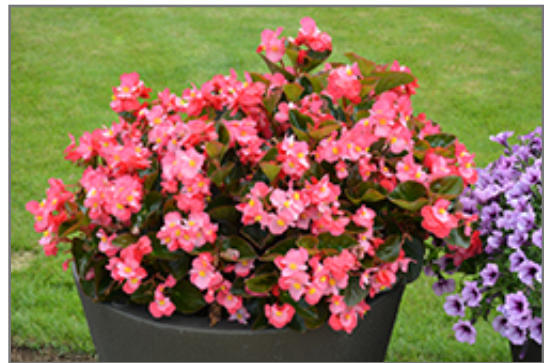
Surefire Rose Begonia in bloom

We are so proud of the nursery stock that we have carefully selected for superior quality and performance, WE GUARANTEE ALL TREES, SHRUBS, EVERGREENS FOR 2 YEARS, AND ROSES FOR 1 YEAR!