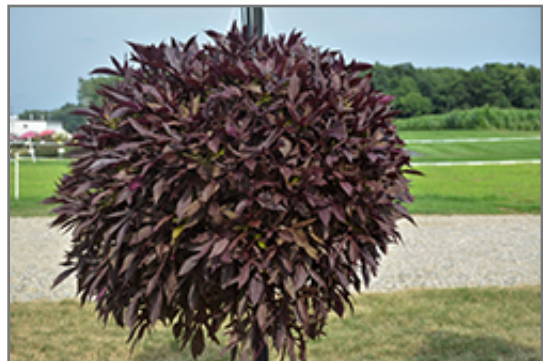
Illusion Garnet Lace Sweet Potato Vine

We are so proud of the nursery stock that we have carefully selected for superior quality and performance, WE GUARANTEE ALL TREES, SHRUBS, EVERGREENS FOR 2 YEARS, AND ROSES FOR 1 YEAR!