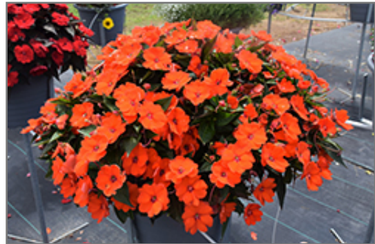
SunPatens Compact Electric Orange New Guinea Impatiens in bloom