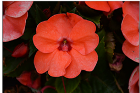
SunPatiens Compact Hot Coral New Guinea Impatiens flowers

SunPatiens Compact Hot Coral New Guinea Impatiens is a dense herbaceous annual with a mounded form. Its medium texture blends into the garden, but can always be balanced by a couple of finer or coarser plants for an effective composition.