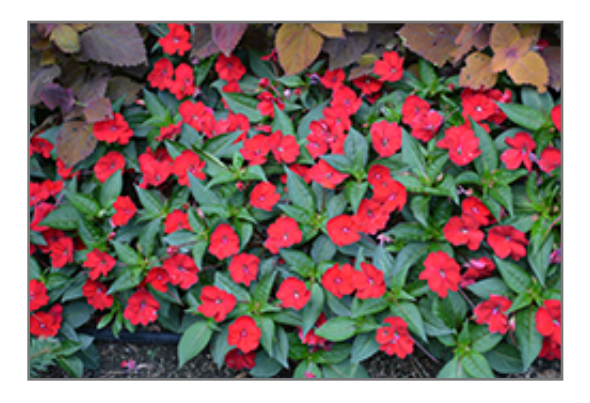
SunPatiens Compact Red New Guinea Impatiens in bloom