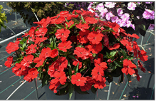
SunPatiens Compact Red New Guinea Impatiens in bloom