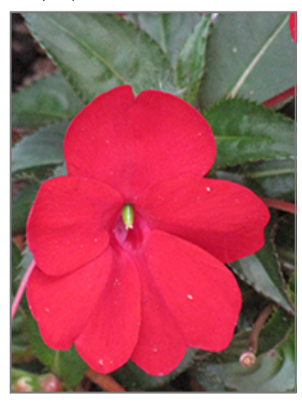
SunPatiens Compact Red New Guinea Impatiens flowers

SunPatiens Compact Red New Guinea Impatiens is a dense herbaceous annual with a mounded form. Its medium texture blends into the garden, but can always be balanced by a couple of finer or coarser plants for an effective composition.