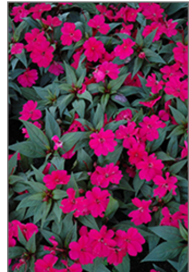
SunPatens Compact Royal Magenta New Guinea Impatiens flowers

We are so proud of the nursery stock that we have carefully selected for superior quality and performance, WE GUARANTEE ALL TREES, SHRUBS, EVERGREENS FOR 2 YEARS, AND ROSES FOR 1 YEAR!