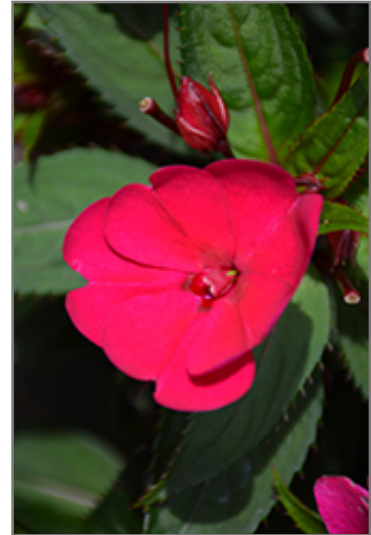
SunPatens Compact Royal Magenta New Guinea Impatiens flowers

SunPatens Compact Royal Magenta New Guinea Impatiens is a dense herbaceous annual with a mounded form. Its medium texture blends into the garden, but can always be balanced by a couple of finer or coarser plants for an effective composition.