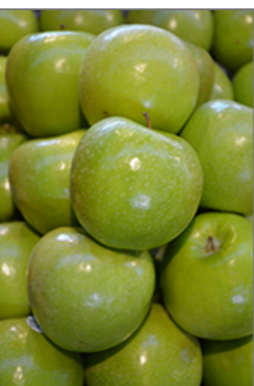
Granny Smith Apple fruit