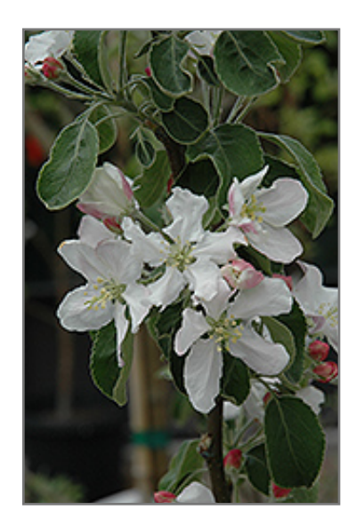
Granny Smith Apple flowers Photo courtesy of NetPS Plant Finder

Granny Smith Apple fruit Photo courtesy of NetPS Plant Finder