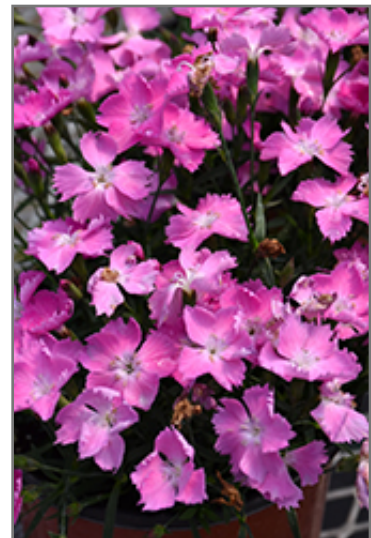
Beauties Kahori Pink Pinks flowers

We are so proud of the nursery stock that we have carefully selected for superior quality and performance, WE GUARANTEE ALL TREES, SHRUBS, EVERGREENS FOR 2 YEARS, AND ROSES FOR 1 YEAR!