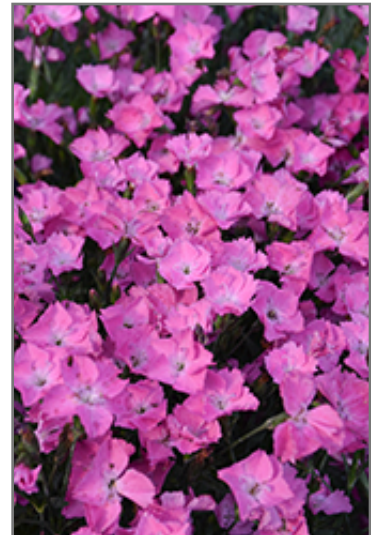
Beauties Kahori Pink Pinks flowers

Beauties Kahori Pink Pinks is an herbaceous evergreen perennial with a mounded form. It brings an extremely fine and delicate texture to the garden composition and should be used to full effect.