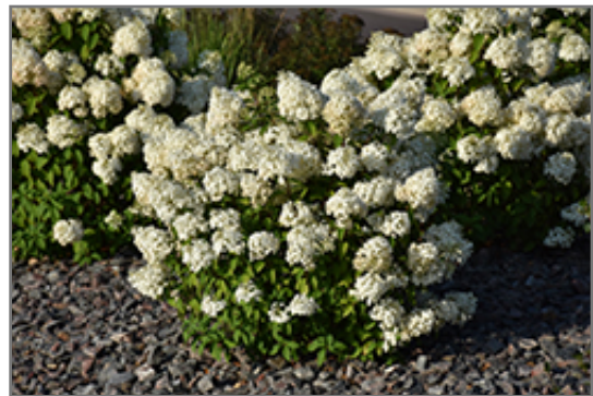
Bobo Hydrangea in bloom

We are so proud of the nursery stock that we have carefully selected for superior quality and performance, WE GUARANTEE ALL TREES, SHRUBS, EVERGREENS FOR 2 YEARS, AND ROSES FOR 1 YEAR!