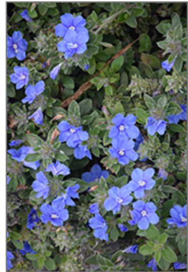
Blue My Mind Morning Glory flowers

Blue My Mind Morning Glory is recommended for the following landscape applications;