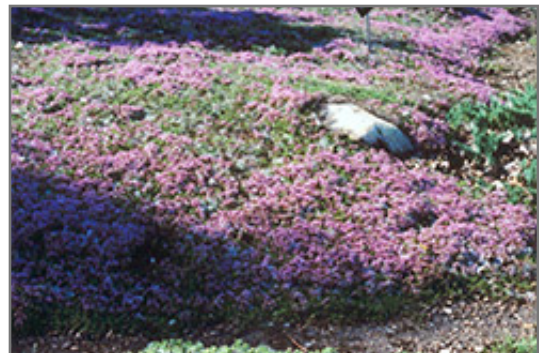
Mother-of-Thyme in bloom

We are so proud of the nursery stock that we have carefully selected for superior quality and performance, WE GUARANTEE ALL TREES, SHRUBS, EVERGREENS FOR 2 YEARS, AND ROSES FOR 1 YEAR!