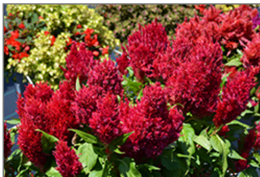
First Flame Red Celosia flowers

We are so proud of the nursery stock that we have carefully selected for superior quality and performance, WE GUARANTEE ALL TREES, SHRUBS, EVERGREENS FOR 2 YEARS, AND ROSES FOR 1 YEAR!