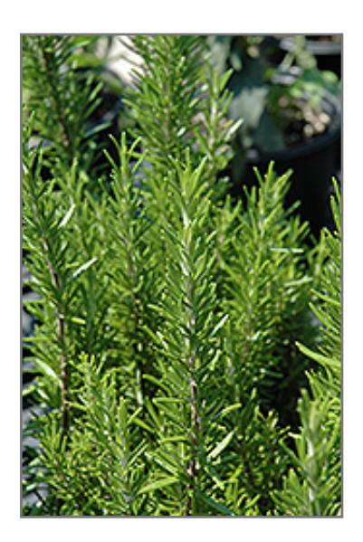
Barbeque Rosemary foliage