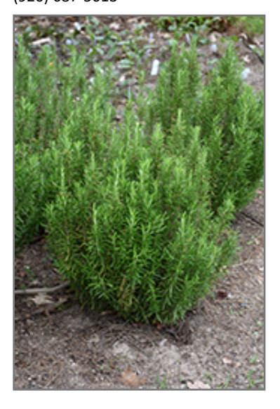
Barbeque Rosemary

Barbeque Rosemary will grow to be about 6 feet tall at maturity, with a spread of 3 feet. Although it's not a true annual, this plant can be expected to behave as an annual in our climate if left outdoors over the winter, usually needing replacement the following year. As such, gardeners should take into consideration that it will perform differently than it would in its native habitat.