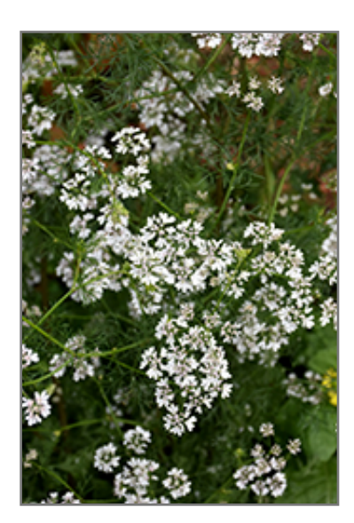
Cilantro flowers