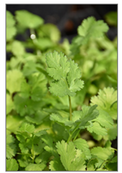
Cilantro foliage

Big Bend S71 W23445 National (262) 662-5800