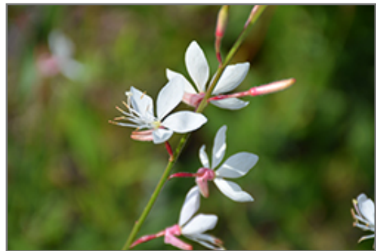
Sparkle White Gaura flowers

We are so proud of the nursery stock that we have carefully selected for superior quality and performance, WE GUARANTEE ALL TREES, SHRUBS, EVERGREENS FOR 2 YEARS, AND ROSES FOR 1 YEAR!