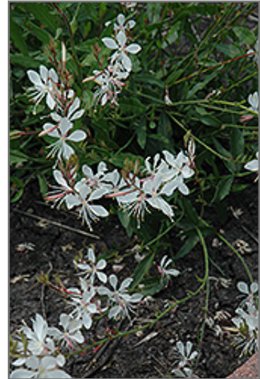
Sparkle White Gaura flowers

Sparkle White Gaura is an open herbaceous perennial with tall flower stalks held atop a low mound of foliage. It brings an extremely fine and delicate texture to the garden composition and should be used to full effect.