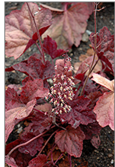
Lava Lamp Coral Bells flowers

We are so proud of the nursery stock that we have carefully selected for superior quality and performance, WE GUARANTEE ALL TREES, SHRUBS, EVERGREENS FOR 2 YEARS, AND ROSES FOR 1 YEAR!