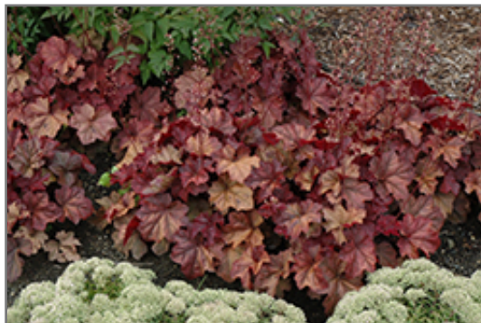
Lava Lamp Coral Bells