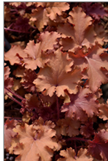
Peach Crisp Coral Bells foliage

Peach Crisp Coral Bells is a fine choice for the garden, but it is also a good selection for planting in outdoor pots and containers. With its upright habit of growth, it is best suited for use as a 'thriller' in the 'spiller-thriller-filler' container combination; plant it near the center of the pot, surrounded by smaller plants and those that spill over the edges. Note that when growing plants in outdoor containers and baskets, they may require more frequent waterings than they would in the yard or garden. Be aware that in our climate, most plants cannot be expected to survive the winter if left in containers outdoors, and this plant is no exception. Contact our experts for more information on how to protect it over the winter months.