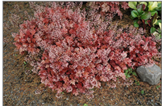
Peach Crisp Coral Bells in bloom

Peach Crisp Coral Bells is a dense herbaceous evergreen perennial with tall flower stalks held atop a low mound of foliage. Its relatively fine texture sets it apart from other garden plants with less refined foliage.